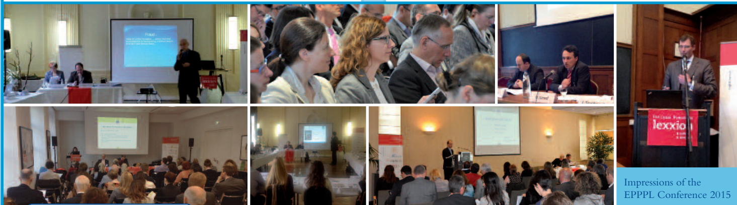
Impressions of the EPPPL Conference 2015